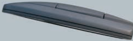
LED 비점화 방폭 가로등