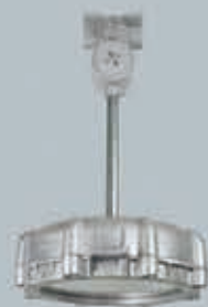
LED 내압 방폭등