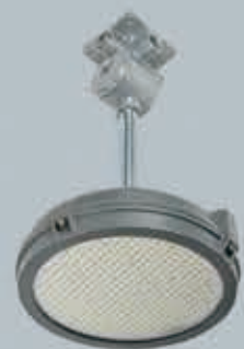
LED 분진 방폭등